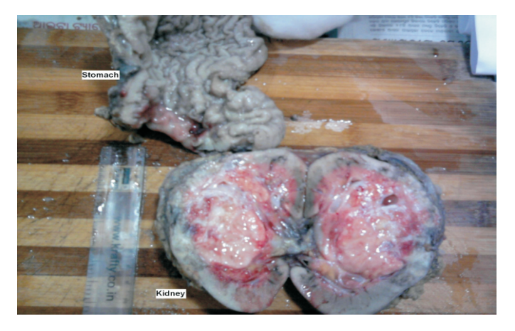
Figure 1. Ulceroproliferative lesion in body of stomach

A 60 year old male presented with dyspepsia, loss of appetite and weight loss. Endoscopy revealed an ulcerated mass in the body of stomach. Ultra Sonography (USG) prior to surgery revealed a mass in Rt. kidney. So a clinical diagnosis of carcinoma stomach with metastasis to Rt. kidney was made. Patient underwent laparotomy for gastrectomy and nephrectomy. Grossly the stomach had ulceroproliferative lesion in lower body measuring 2.8x2.5cm(Figure 1). Histopathology of stomach growth showed an invasive adenocarcinoma of stomach, tubular type(Figure 2). Rt kidney measured 13x9x6cm. C/S showed yellow mass in pelvic region m.5.5 cm. type. Microscopic examination of kidney revealed renal cell carcinoma-clear cell type(Figure 3).